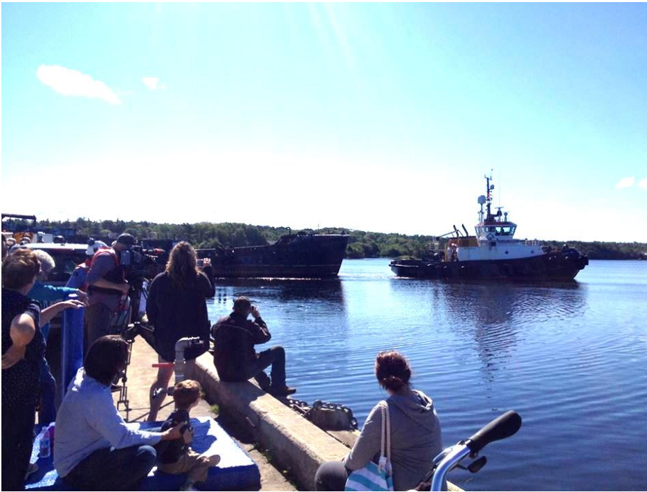
REMOVAL OF THE MV FARLEY MOWAT