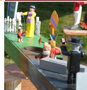
What's Happening Page 2

Visit our website for more information: https://www.town.shelburne.ns.ca/